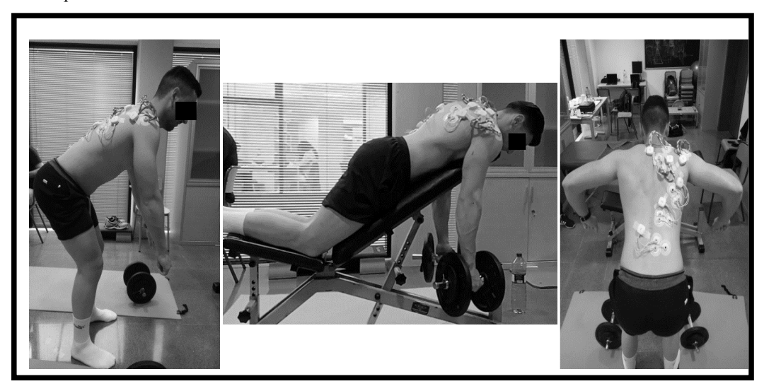
Figure 1. Bipolar Surface electromyographic electrode and wireless sensor placement during the performance of the different study conditions.

muscle contraction speed was determined by a technological metronome "Soundbrenner", following criteria from previous research (Ekstrom, Donatelli, & Soderberg, 2013). Figure 1 shows the electrode positions and the EMG sensor placement.